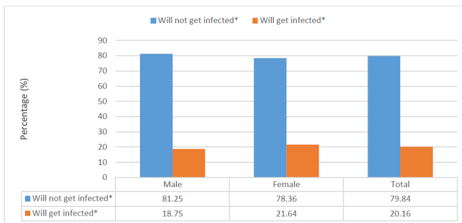
Fig. (1). Percentage distribution of sex by perceived HIV risk among youth respondents.

Table 1 shows the ranked reasons for perceived HIV infection by sex of the respondents. Based on the number of responses for each perception by sex and for both, the authors ranked the most commonly cited perceptions. Among those who feel they will not get HIV, using condoms is the highest ranked (1) reason for both males and females, followed by being faithful to their partner (2), trusting their partner (3), and abstaining from sexual intercourse (4). Among those who feel they will get HIV, there is less consistency in ranking reasons between male and female respondents. For females, being sexually active is ranked the highest (1) but for males not always using condoms is ranked first. For males, being sexually active is ranked second, while for females, not always using condoms is second. Not using a condom is ranked third (3) for female respondents but fourth (4) for males. Finally, not trusting a partner is third (3) for males but fourth (4) for females. These ranking differences continue for all items on the list.